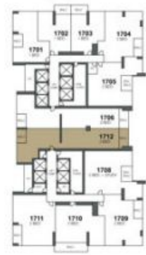
LEVELS 17 - 52